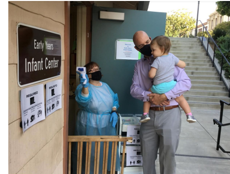
Parent dropping off at our Infant Center