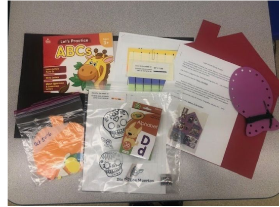
Ms. Cavazos next supply pick up at Harding!